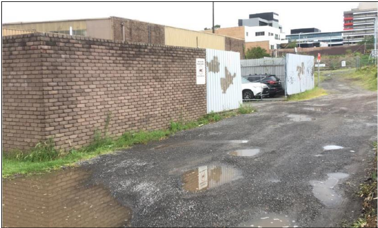
Figure 5 – Unformed Hercules Street located along the southern boundary of the site (looking east)