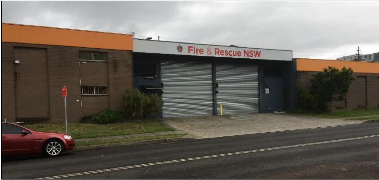
Figure 3 – Existing building occupying the site, viewed from the Denison Street frontage looking east