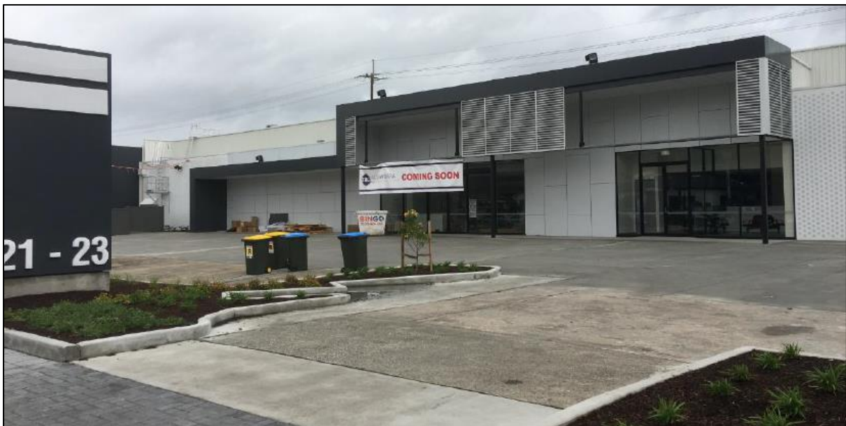
Figure 6 – Adjoining medical/ medical imaging centre to the immediate north of the site, recently completed renovation