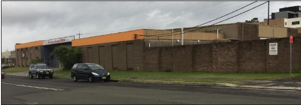
Figure 4 – Existing building occupying the site, viewed from the Denison Street frontage looking north-east